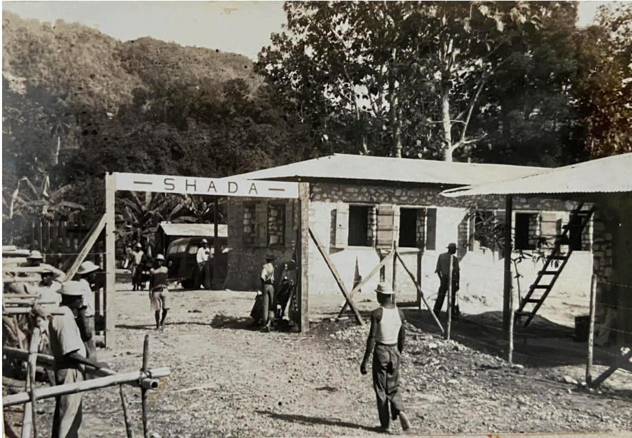
SHADA Base office at Chambellan, 1942.