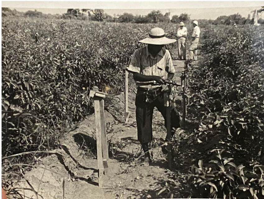
Cryptostegia planting 1943.