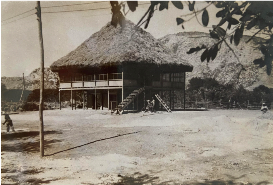
Cryptostegia Research Station, Gonaïves, Living Quarters for Science Staff.