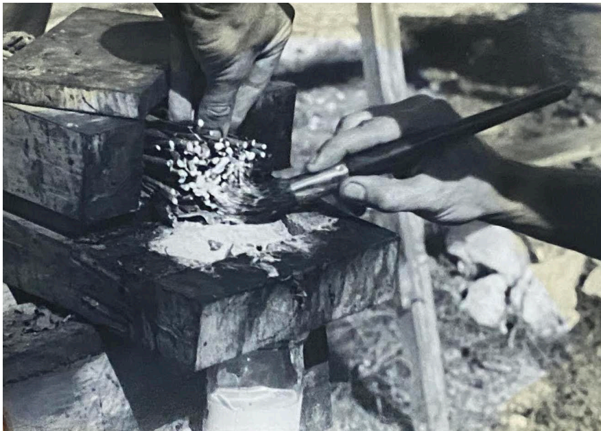
Tapping Cryptostegia for rubber.